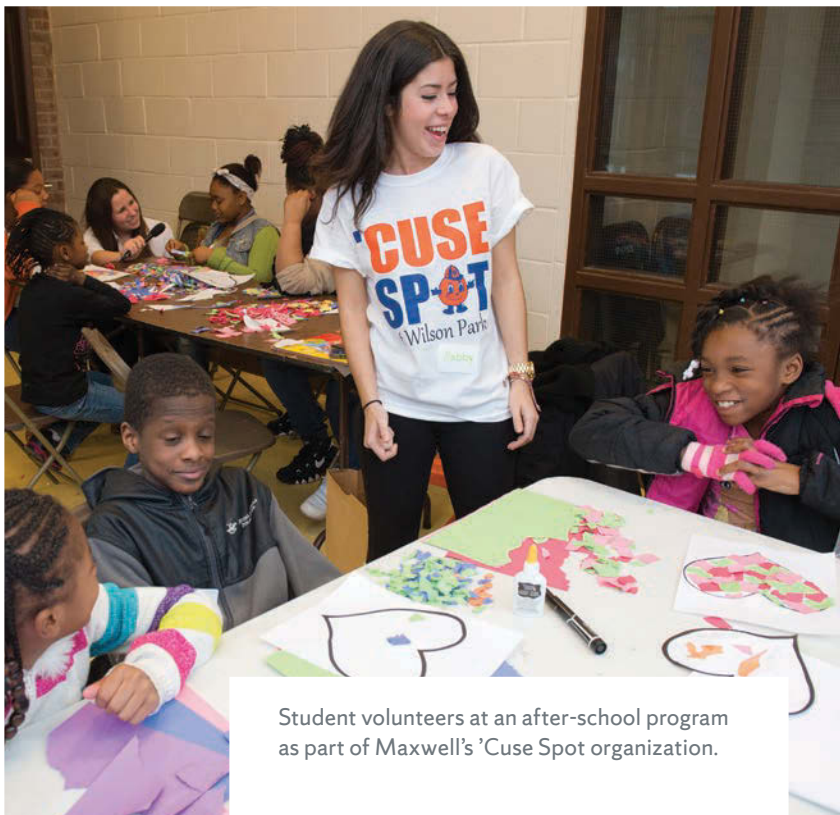
Student volunteers at an after-school program as part of Maxwell's 'Cuse Spot organization.