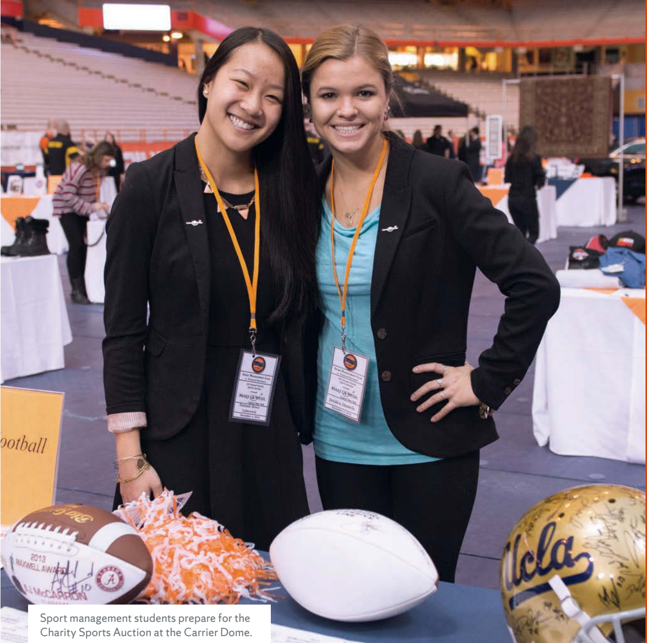
Sport management students prepare for the Charity Sports Auction at the Carrier Dome.