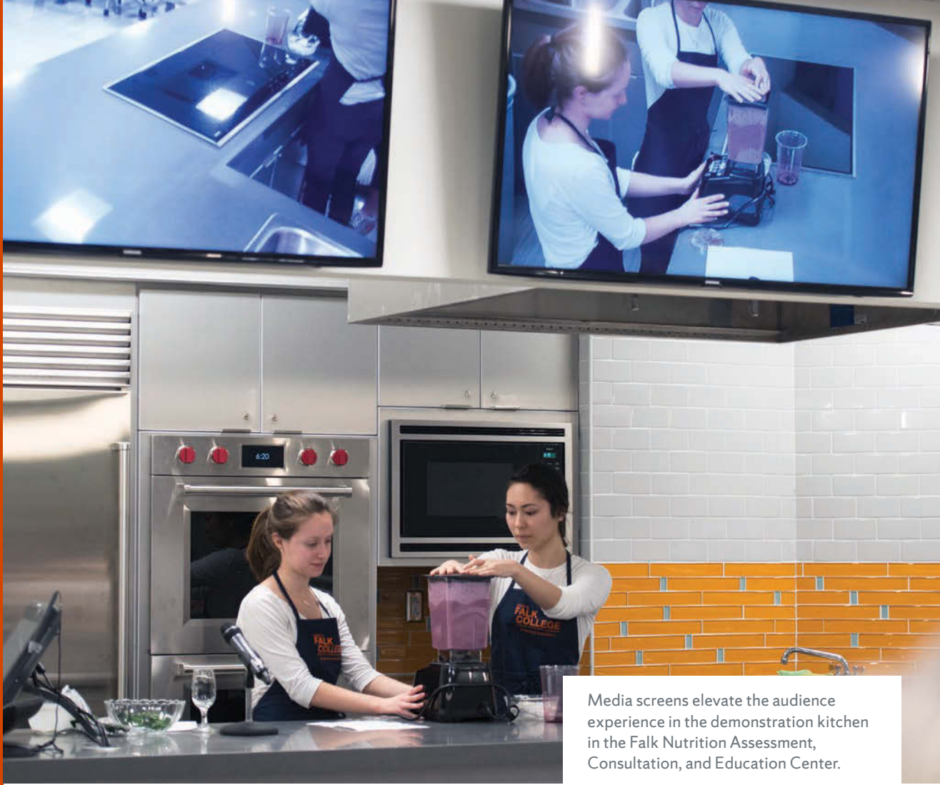
Media screens elevate the audience experience in the demonstration kitchen in the Falk Nutrition Assessment, Consultation, and Education Center.